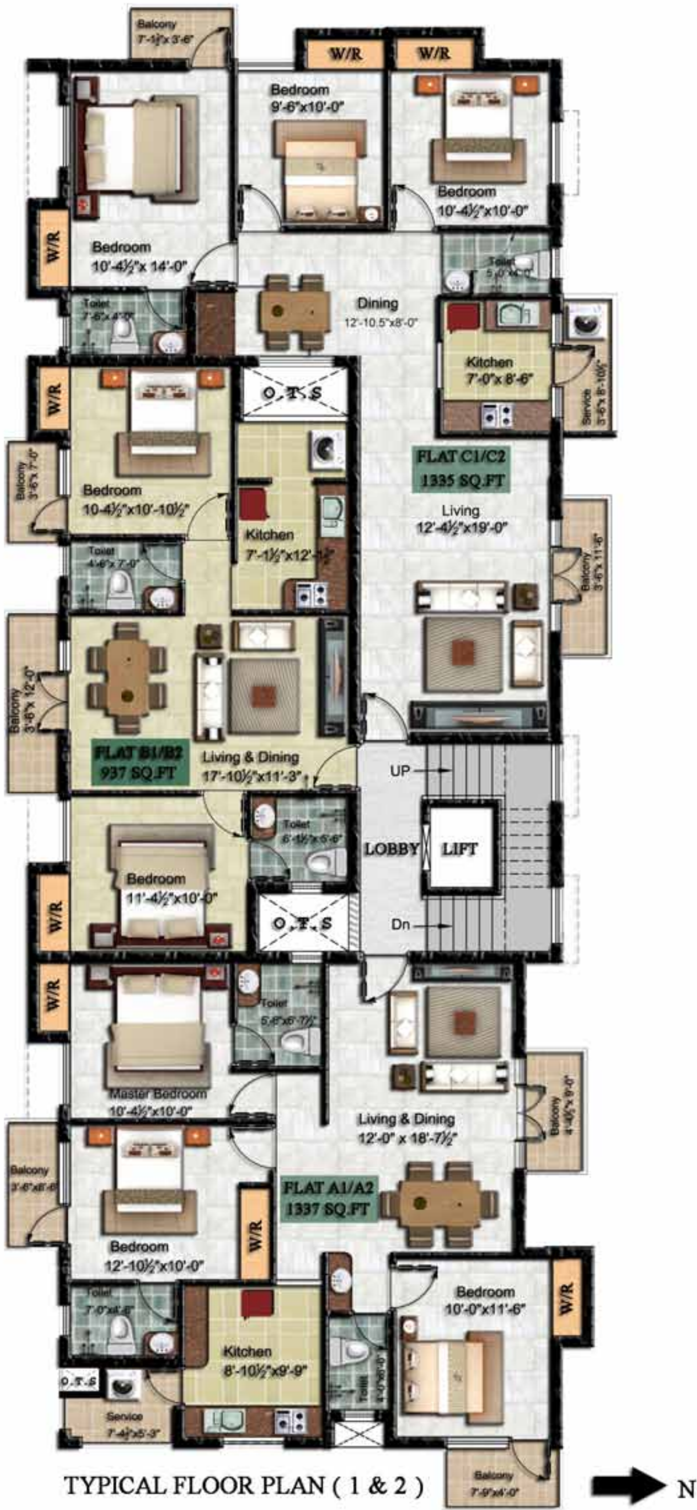
TYPICAL FLOOR PLAN ( 1 & 2 )