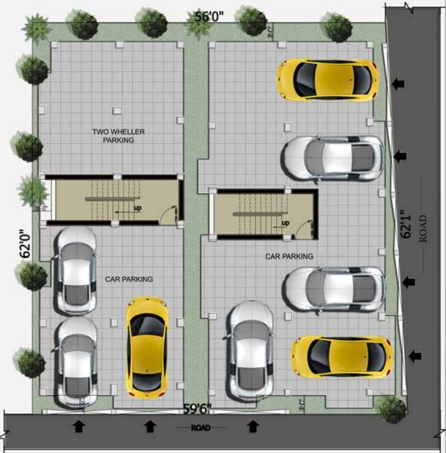
SITE CUM STILT FLOOR PLAN